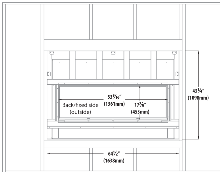
Figure 2.1, Framing Dimensions